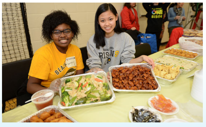
Beachwood students, their families, and members of the community gather for the Bison Feast + Fest, an event filled with diversity, tastes, sights and sounds.