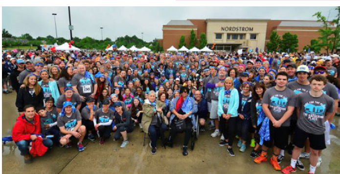
Team Zelman & Associates invites you to join us at Race for the Place. Please register or make a donation today. Every dollary counts!